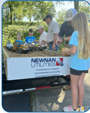
Canongate Elementary Career Day