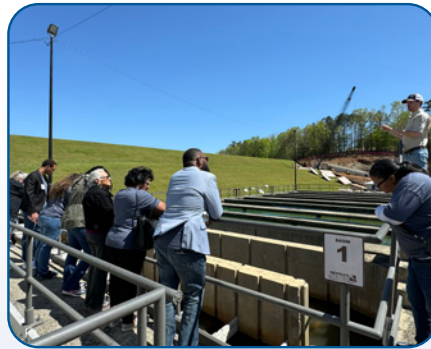
Newnan Citizen Academy