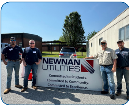
Moreland Elementary Career Day