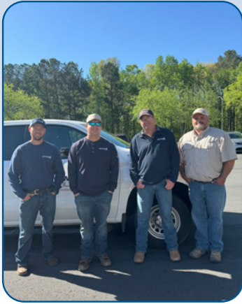
Jefferson Parkway Elementary Career Day