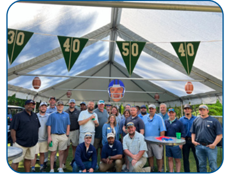
Newnan-Coweta Chamber Golf Classic