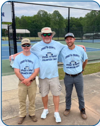
Volunteering at Special Olympics