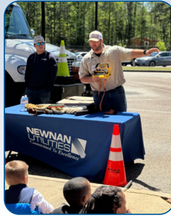
Welch Elementary Career Day