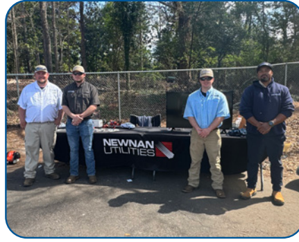
Atkinson Elementary Career Day